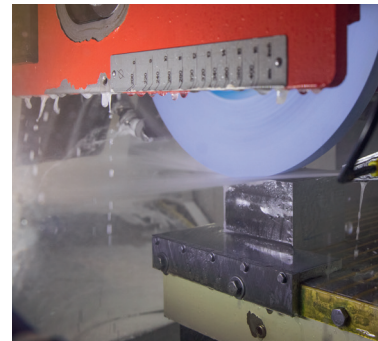
Surface grinding (picture shows Blohm machine)