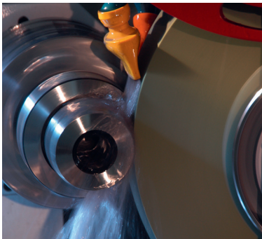
Cylindrical grinding (picture shows Studer machine)