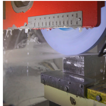
Surface grinding (picture shows Blohm machine)