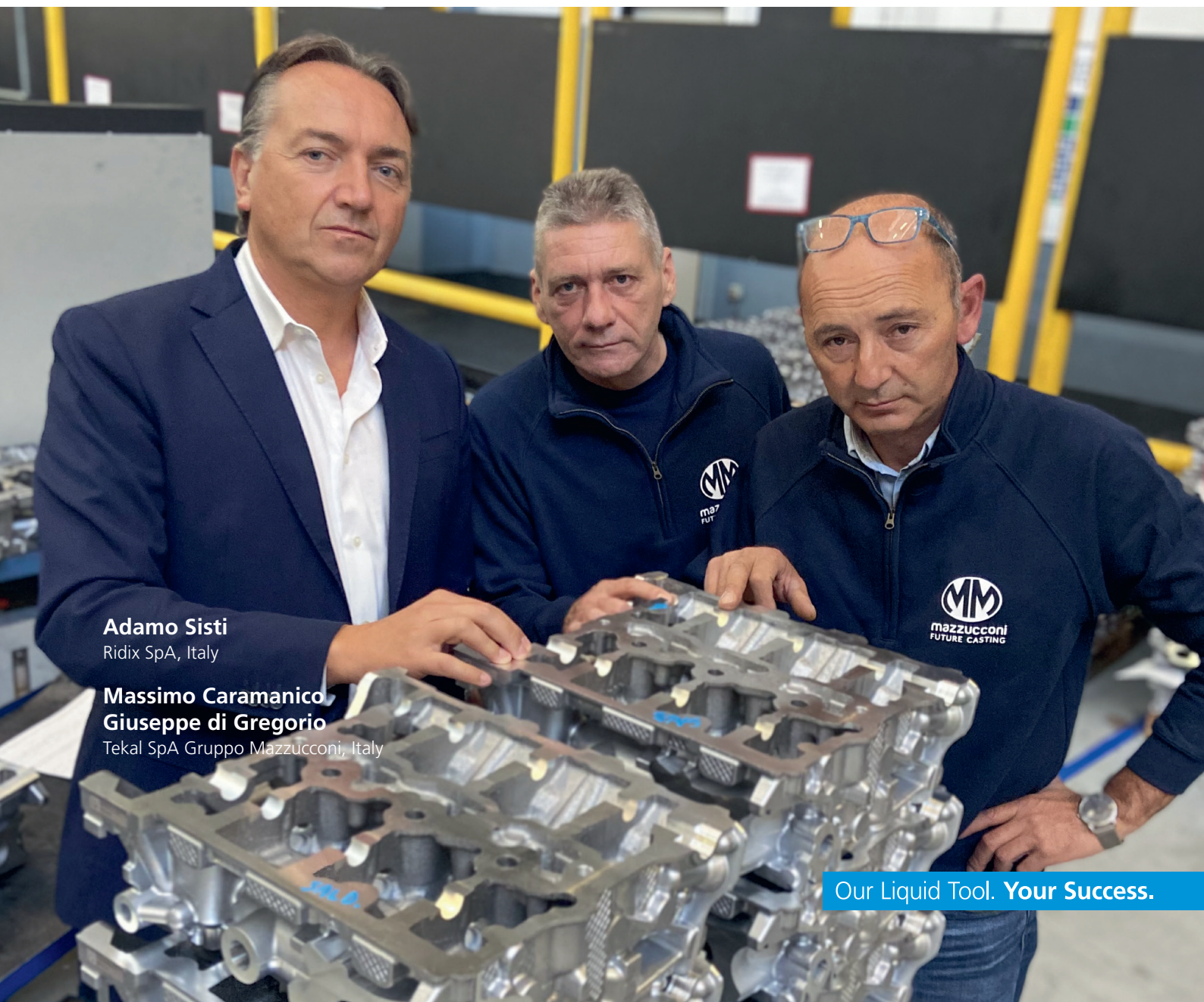
Adamo Sisti Ridix SpA, Italy