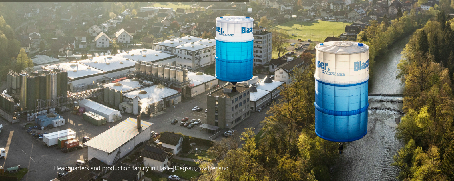
Headquarters and production facility in Hasle-Rüegsau, Switzerland

Gentle to people and the environment – since 1936.