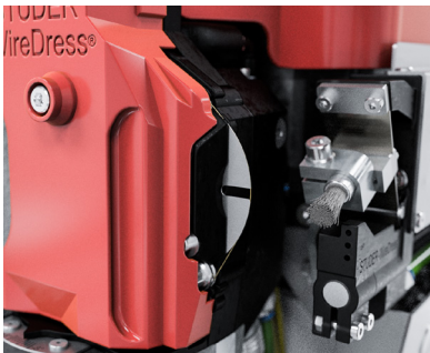
Grinding machines equipped with Studer WireDress